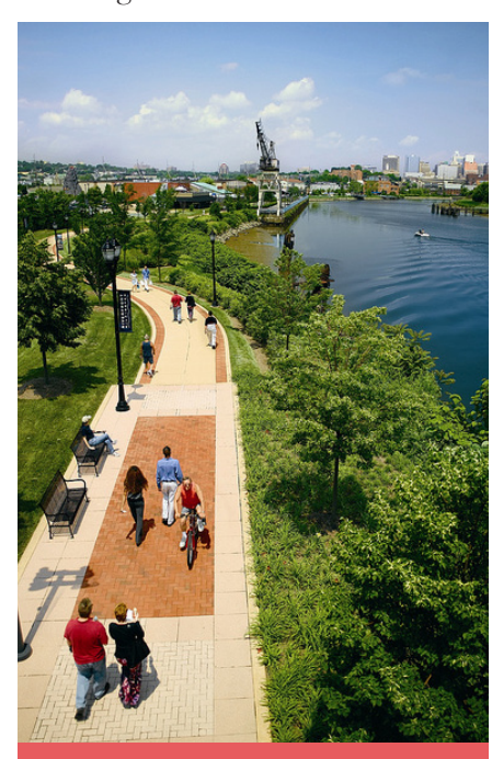
Preventive strategies are critical for managing the costly, far-reaching impacts of obesity and related disease.

In Delaware, as in other places throughout the country, public health and healthcare comprise a major component of spending. The Delaware Department of Health and Social Services is the largest agency in the state, both in terms of number of employees and budget. As concerns about healthcare spending garner much national attention,