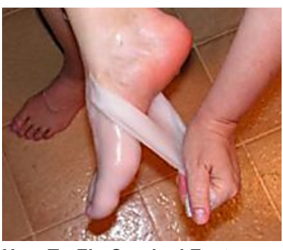
How To Fix Cracked Feet Vital Updates