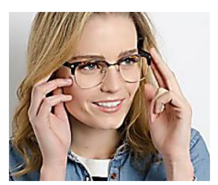
Top 7 Reasons to Get Your Glasses Online