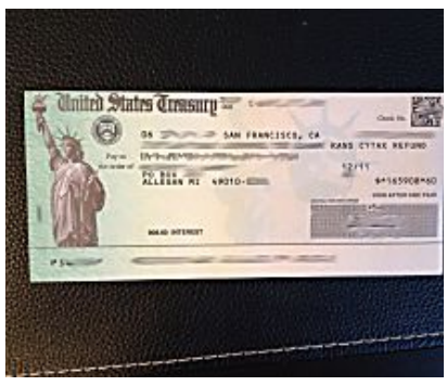
Homeowners With No Missed Payments Better Read This