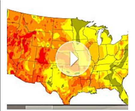
Incredible Map Reveals Energy Discovery That Spans Entire U.S.