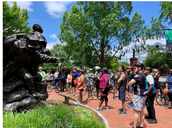
Final destination for riders at Tubman-Garrett Riverfront Park

On Saturday, June 18th, over 100 bicyclists left the New Castle Court House in Historic New Castle on the Delaware Freedom Ride, following the Juneteenth Celebration Route to the Wilmington Riverfront. The ride, a collaboration between DGI and Urban Bike Project , was created in 2021 to honor the journey of Delaware's Freedom Seekers along the Harriet Tubman Underground Railroad . As the riders followed the route, planned stops were made to tell the stories of local individuals who sought their freedom, and helped others to achieve it. We're really glad so many people came out and joined us on this moving ride. We hope to see everyone on the ride next year! Visit our website to view photos of the ride.