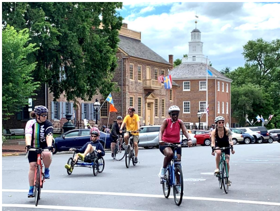
Starting point at the New Castle Court House Museum