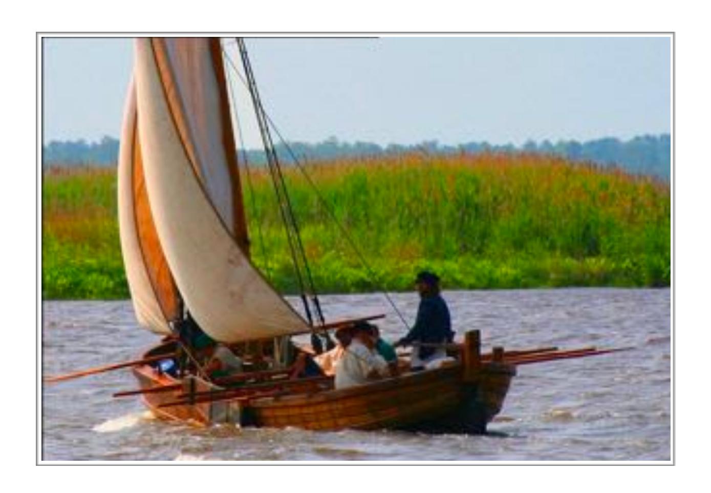
4 Days/3 Nights Gateway City: Baltimore, Maryland